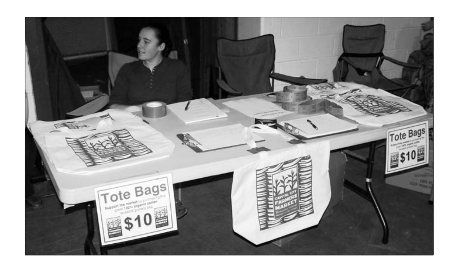
Tote bags for sale at the Thanksgiving Farmers Market, Montpelier

Markets that have an identifying logo can raise money through the sale of tote bags,