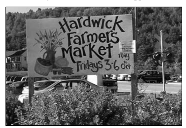
Permanent sign at the Hardwick Farmers Market

Permanent signs at the market's location are even more effective. Some markets use banners hung across streets or on lampposts as