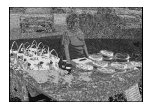
Pie vendor at the Chelsea Farmers Market

This tax is on retail sales in Vermont. At a farmers market, this would apply to vendors selling crafts and non-edible horticultural products. The tax rate is currently 6%, and a tax chart can be found in Appendix VII or online at the VT Department of Taxes, www.state.vt.us/tax.