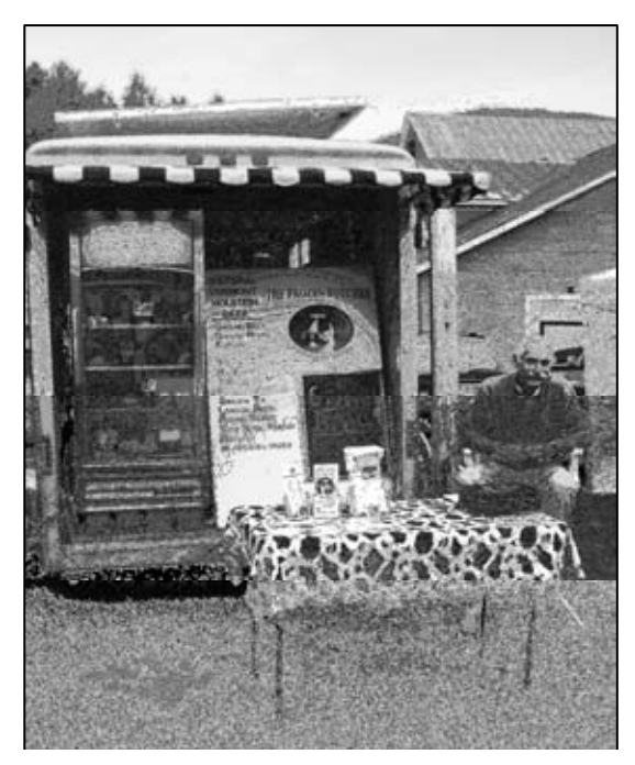
Beef Vendor, Mad River Green Farmers Market

Your selection of vendors is what makes your market appealing to your customers. So you must make your market appealing to the type of vendors you want to attract. As you determine your market layout, pay attention to how vendors will enter and exit the market.