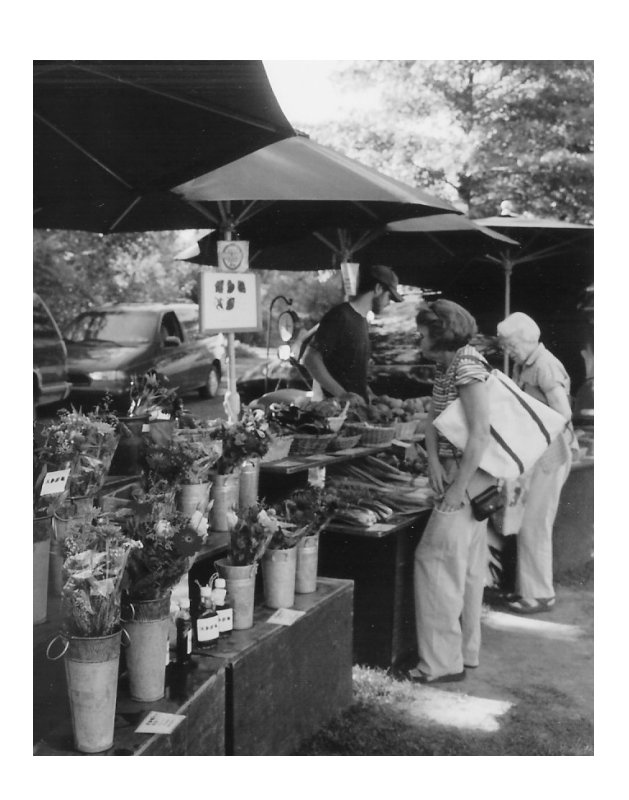
Jericho Farmers' Market