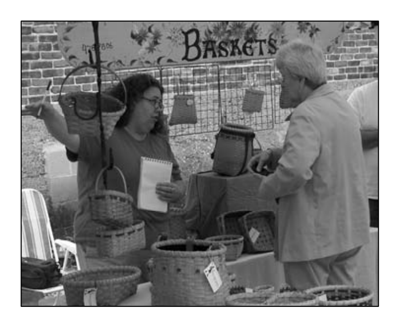
Capital City Farmers' Market

Encourage vendors to use their entire space, rather than just setting up tables at the front of their space. Before giving out extra space to a vendor, encourage them to fully utilize all the space they already have. Too much space can lead to sparse displays. Farmers are usually allowed extra space at markets because of the bulk of their product. Sometimes farmers rent more than one space to accommodate greater product volumes.