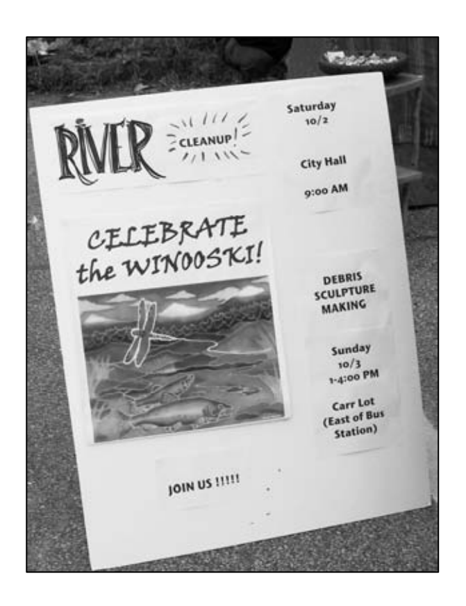
Non-profit display at farmers market

You may decide to provide space for nonprofit organizations to promote their work at your market. This can provide educational opportunities for the public. However, you should be cautious about potential controversy surrounding each group's work and its effect on the neutrality of your market.