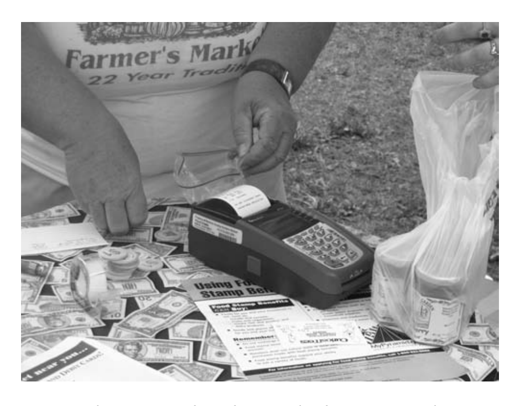
Electronic Card Reader at Rutland Farmers' Market

For more information please contact the NOFA-VT office: 802-434-4122.