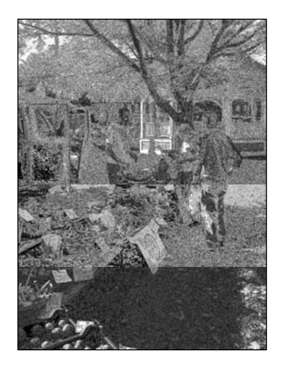
Barre Farmers' Market