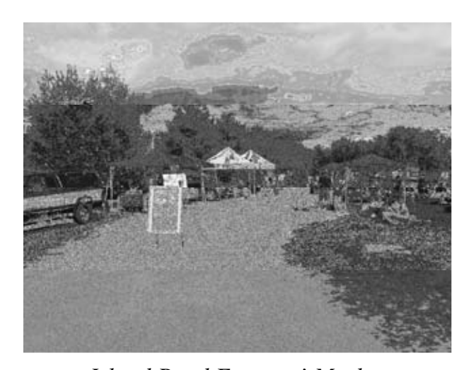
Island Pond Farmers' Market

Other Concerns—Are there public restrooms close by? Are you near a public transportation stop?