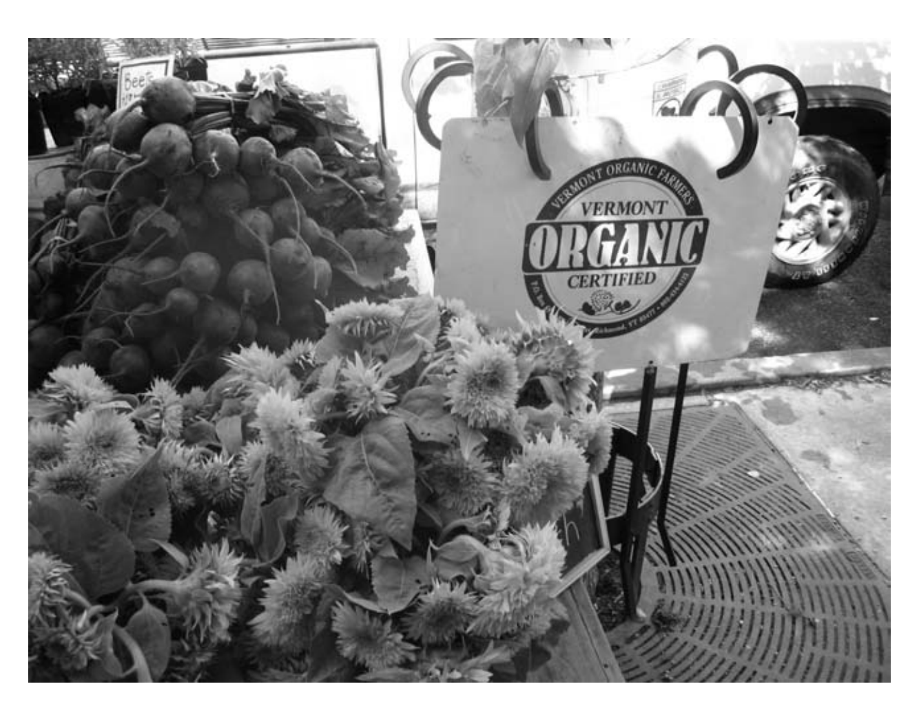
Keeping signs off of the ground reduces tripping hazards

Please review the article in Appendix IV to learn more about risk management.