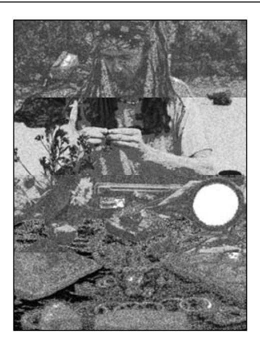
Craft Vendor at the Capital City Farmers