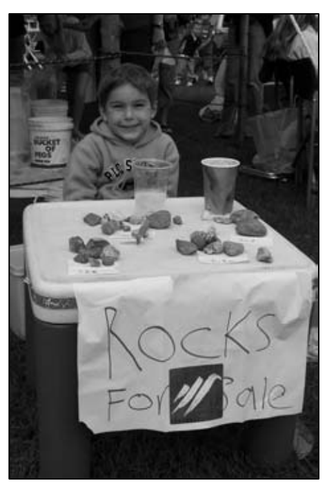
Young vendor at the Mad River Green Farmers Market

Make your market a weekly destination for families by staging a weekly activity for kids. Incorporate themes about local agriculture and community. One market in Vermont has a Children's Garden Day. Every child receives a free vegetable or flower plant to pot. Then later in the season, the children are invited back to receive prizes for their gardening efforts. Potato or other vegetable prints, worm bins, and planting seeds are also popular ideas.